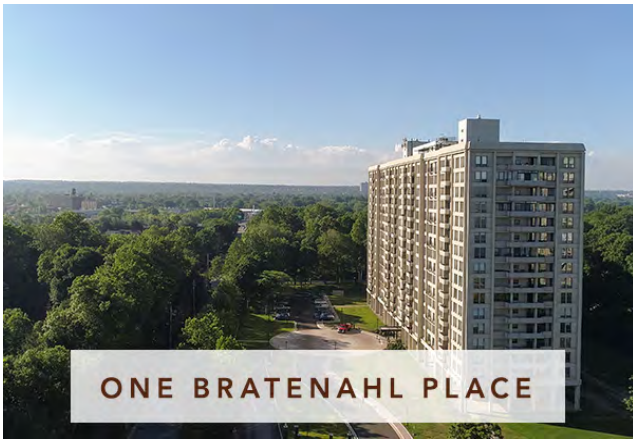
ONE BRATENAHL PLACE

The Newsletter of the Gardeners of Greater Cleveland